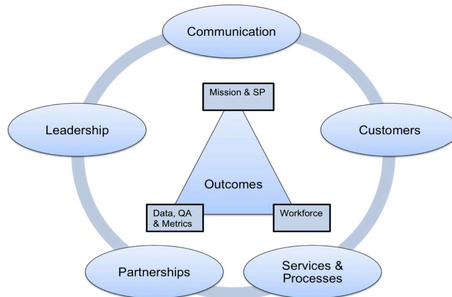
VR Program Management Framework

Image description: Triangle at center with text box - "Outcomes." Text boxes at each of the three triangle points: top - "Mission and SP," bottom right - "Workforce," bottom left - "Data, QA & Metrics." Ring surrounds the triangle with text boxes (clockwise) at top - "Communication," right - "Customers," bottom right - "Service & Processes," bottom left - "Partnerships" left - "Leadership."